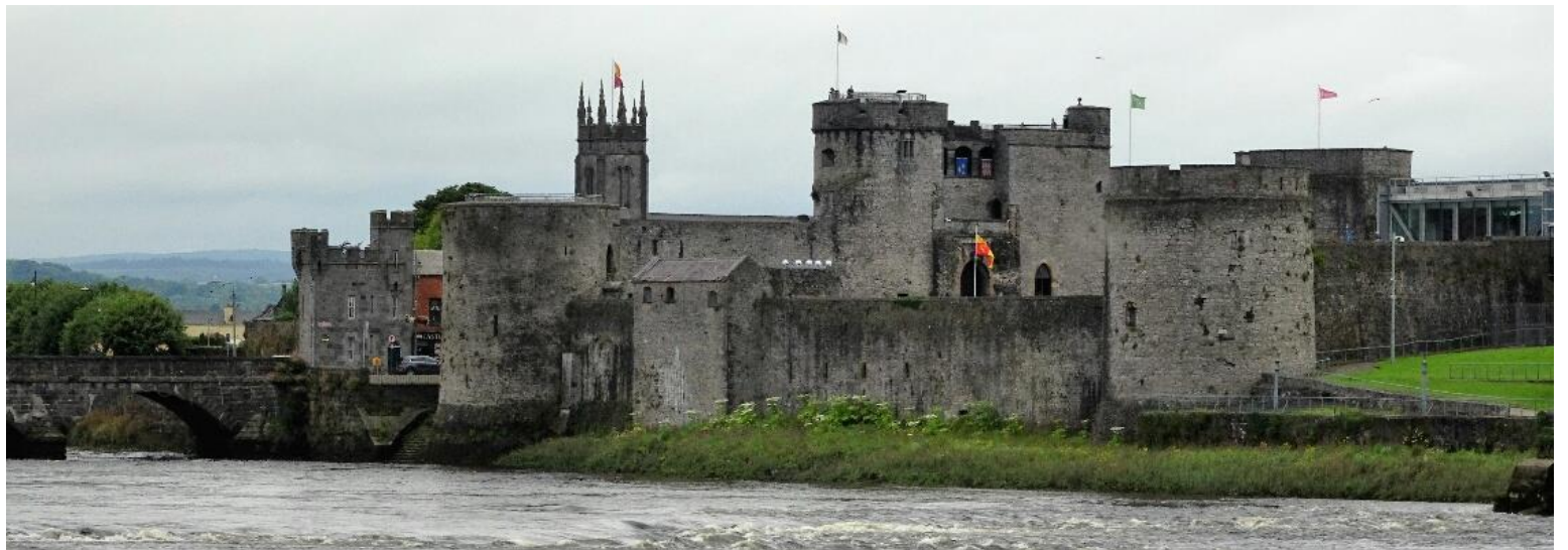
King John's Castle