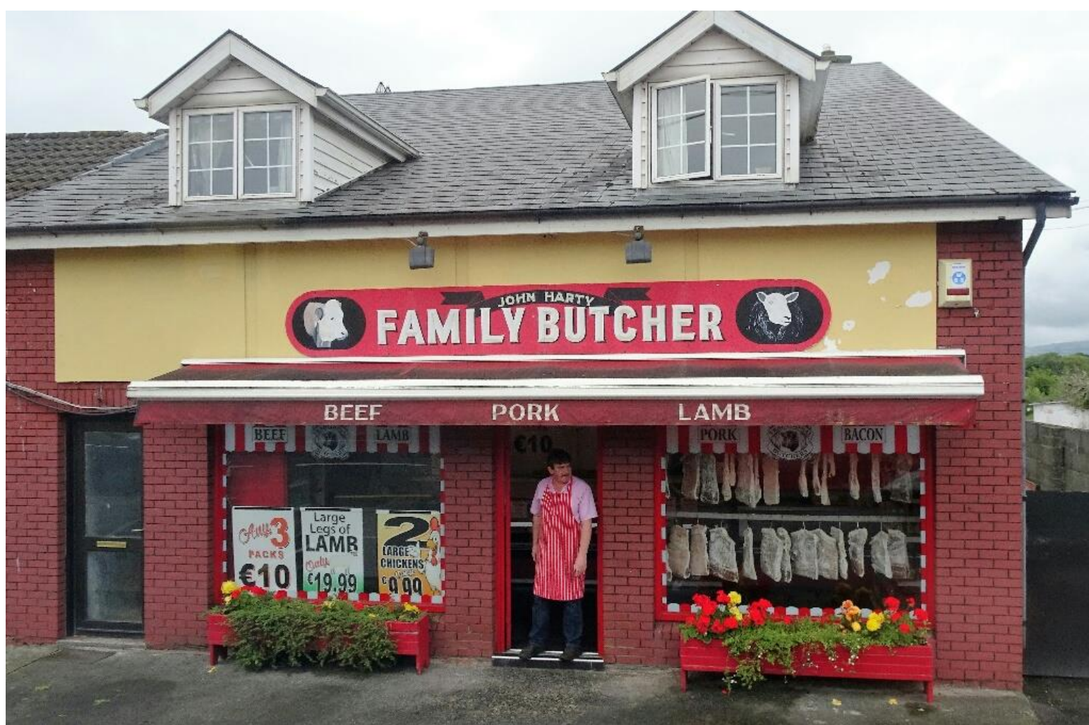
It's a Long Way to Tipperary