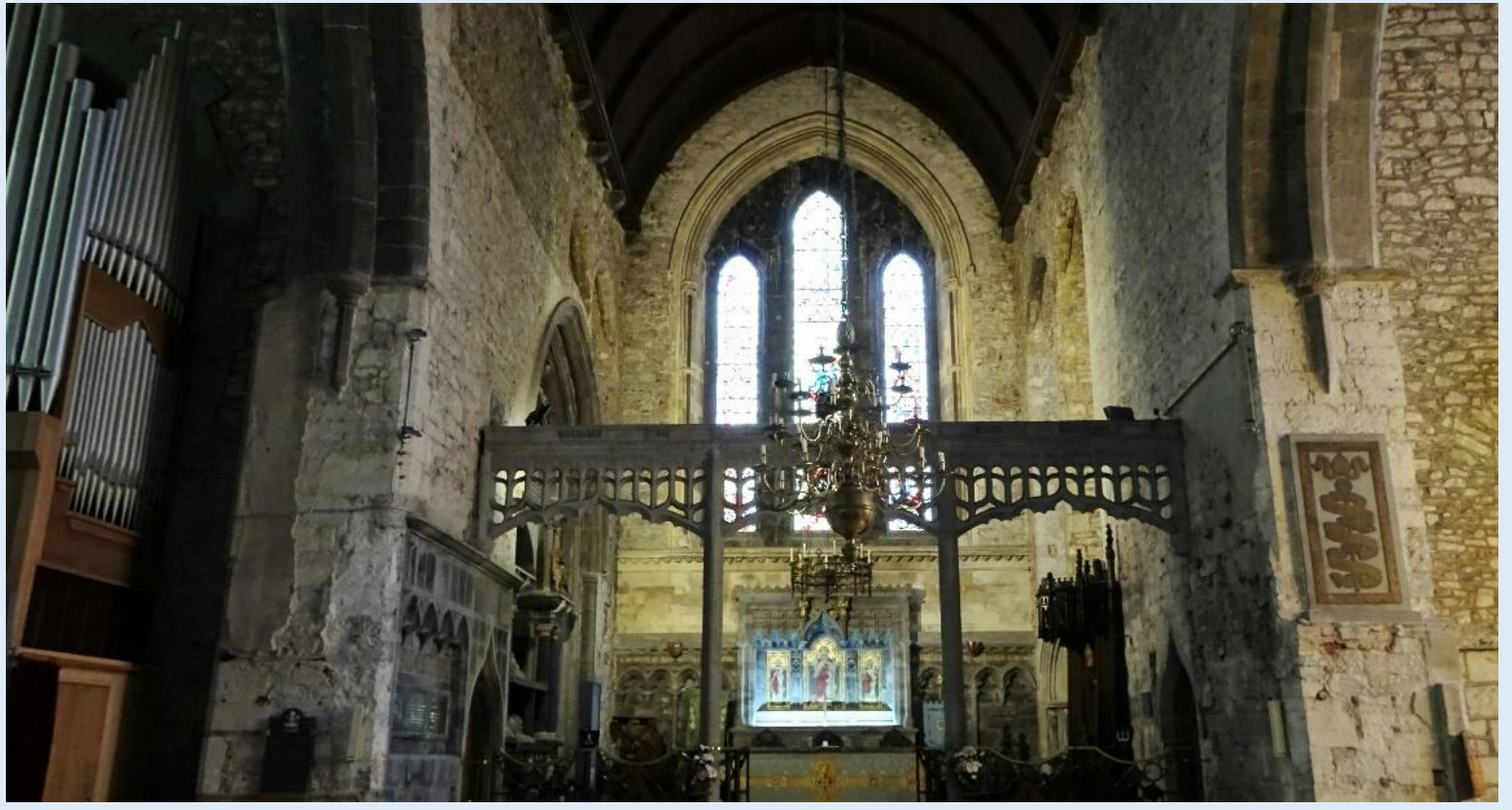
Limerick Saint Mary's Cathedral