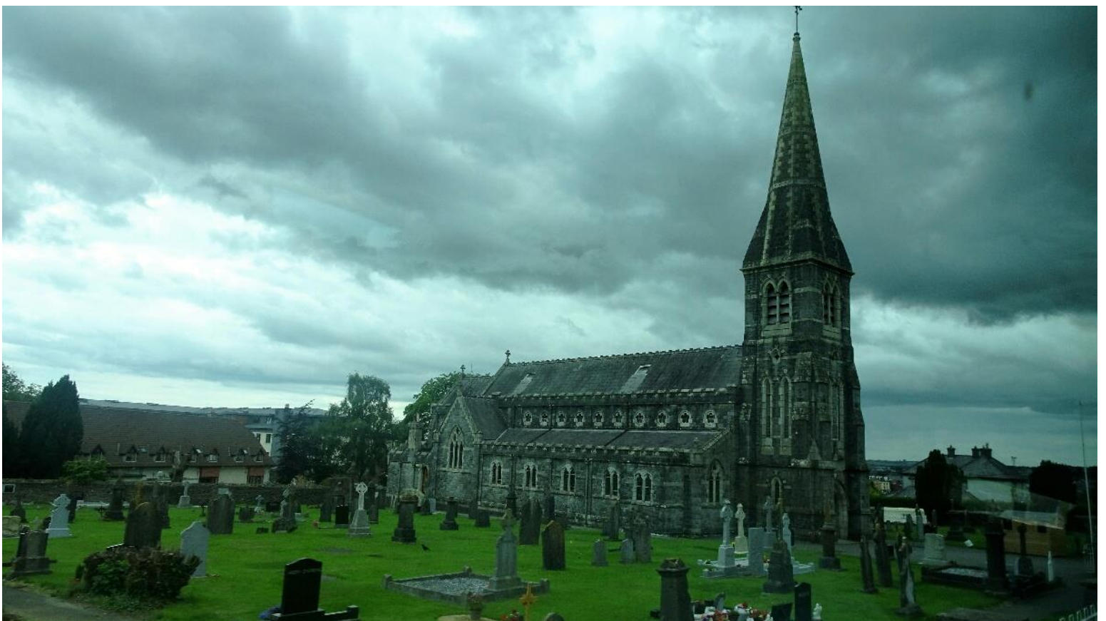
Waterford Church of Sacred Heart