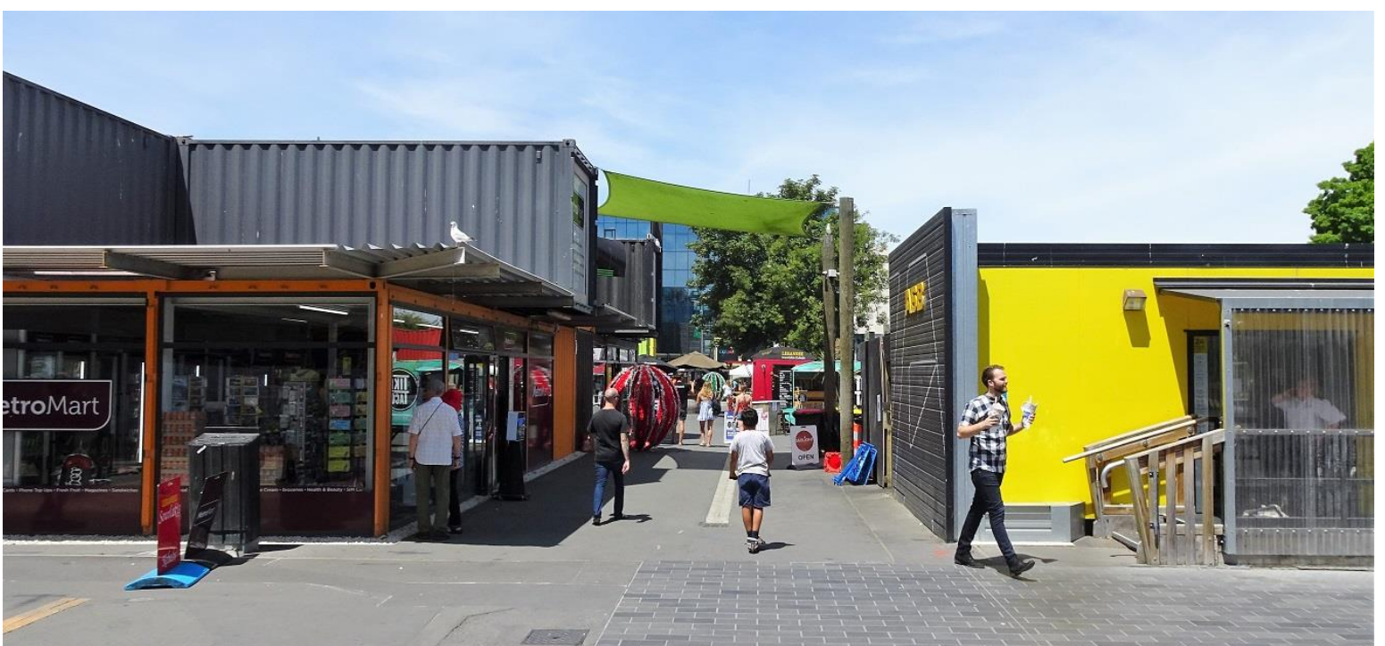
3. Christchurch Mall