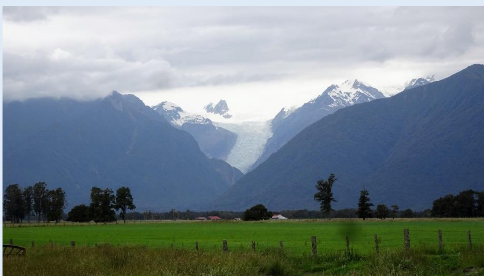
12. Fox Glacier