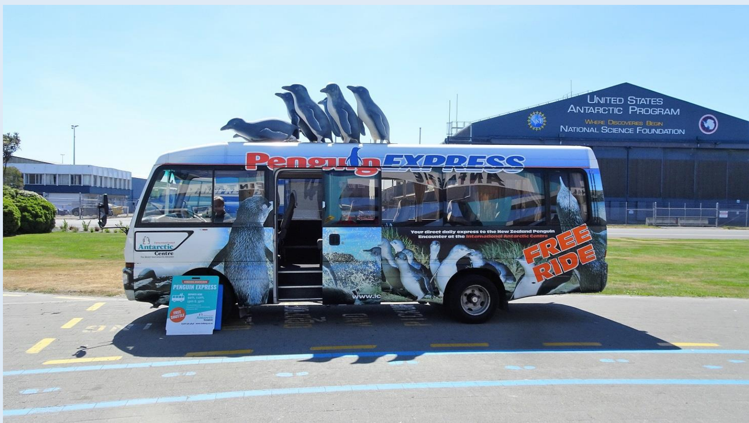
5. Christchurch Antarctic Centre