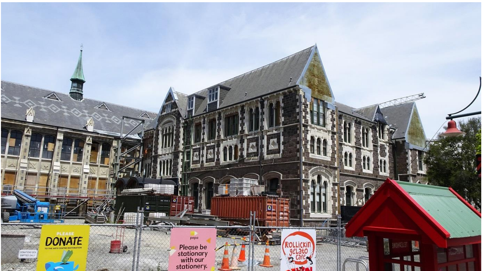
2. Christchurch Arts Center