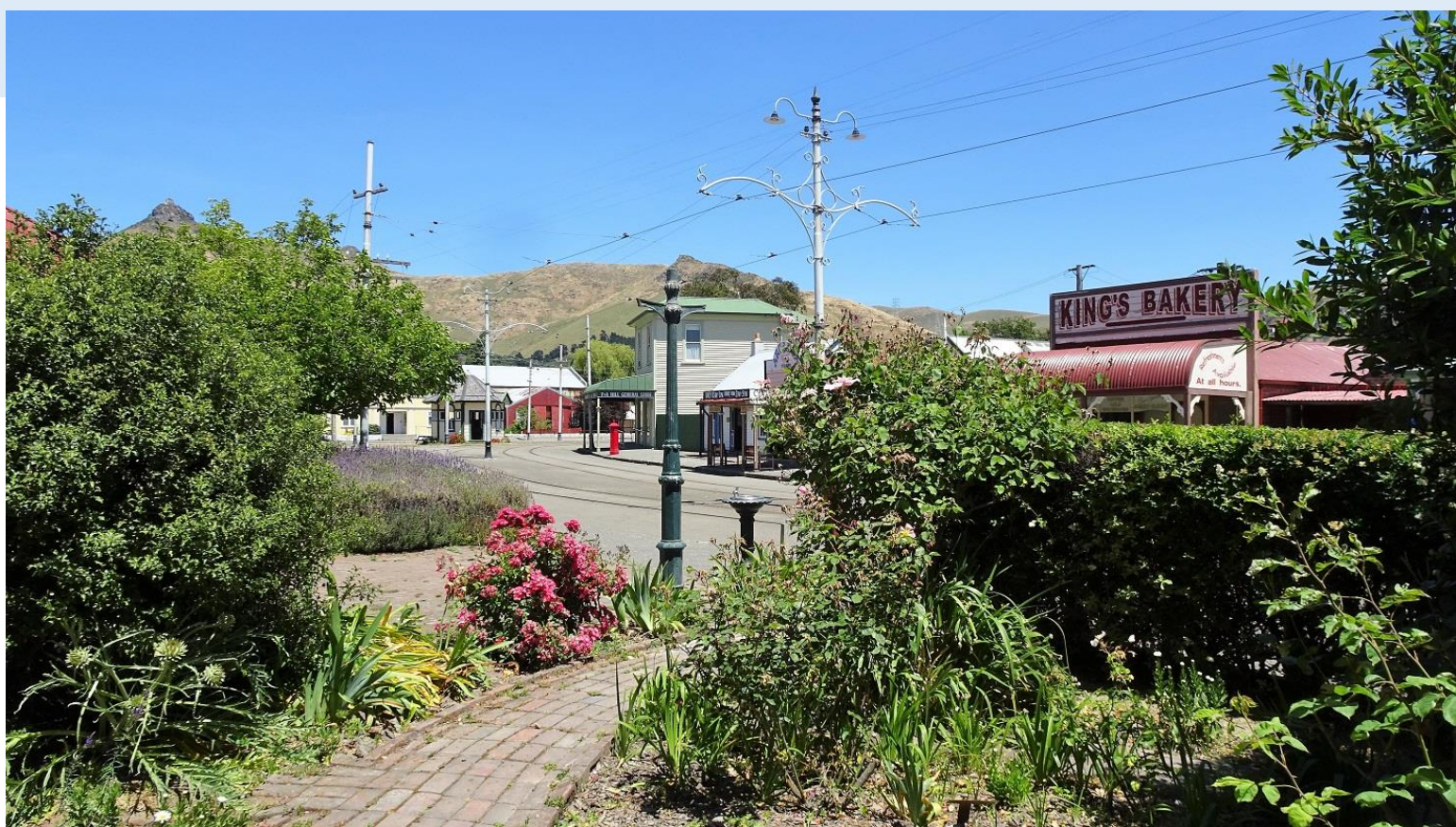
6. Ferrymead Heritage Park