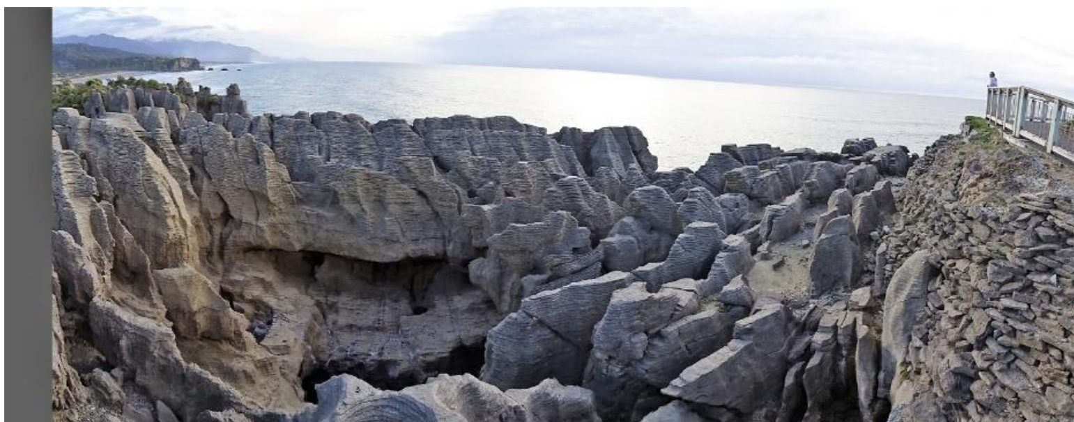
11. Pancake Rocks