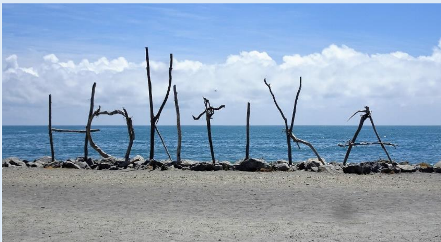
9. Hokitika Beach