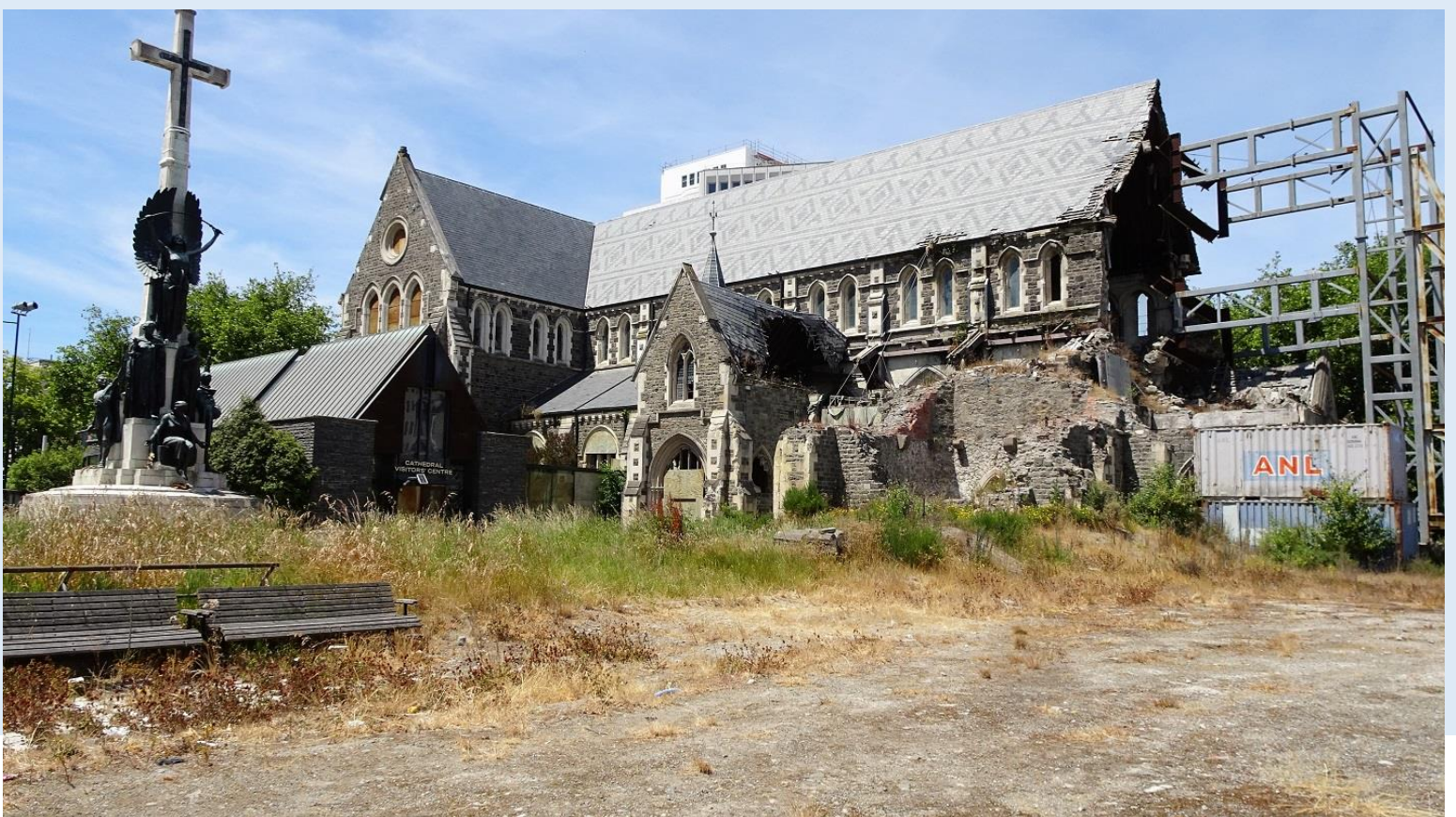
1. Christchurch Cathedral

Driving up the west side of the island is a series of beaches (9), Bays (10), geological oddities (11) and glaciers (12). Picton (13) was the last stop on the southern island and the ferry boat gateway to the northern island.