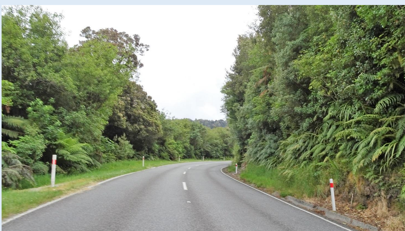
8. Highway 6