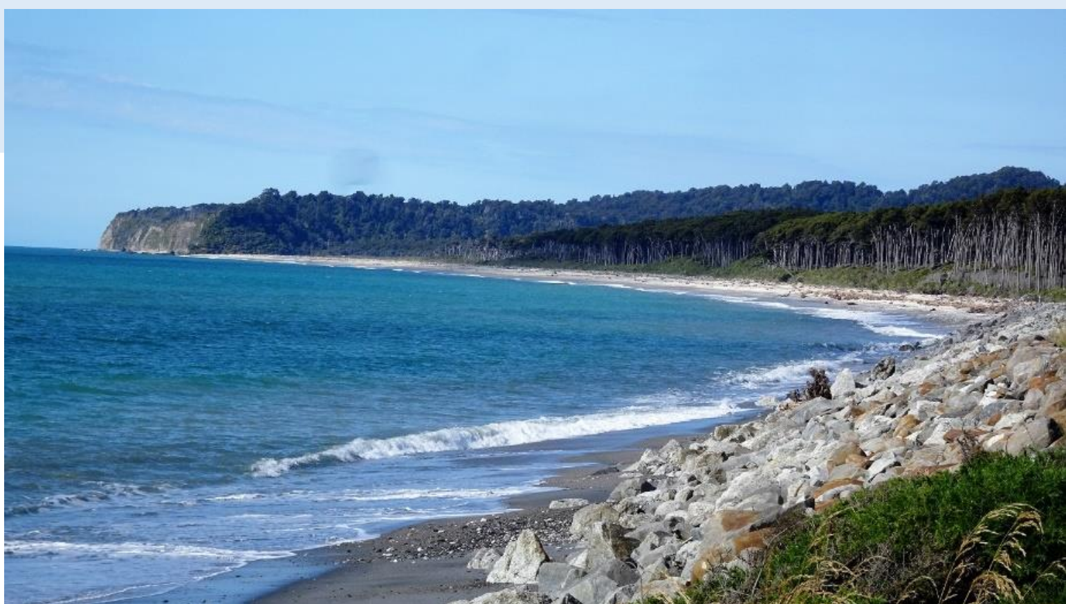
10. Bruce Bay