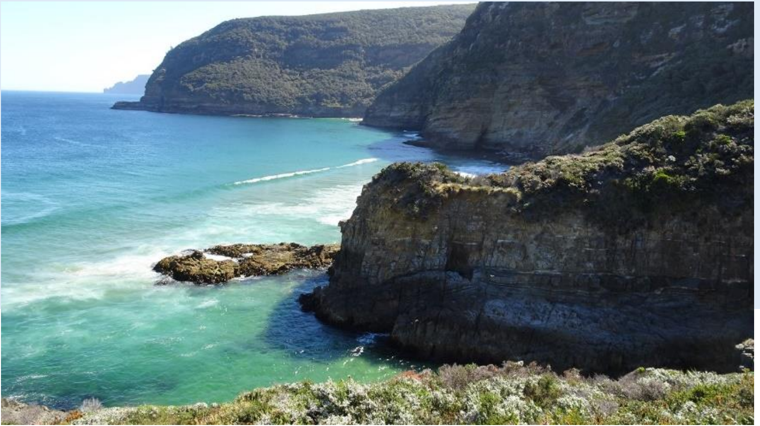
5 Maingon Lookout