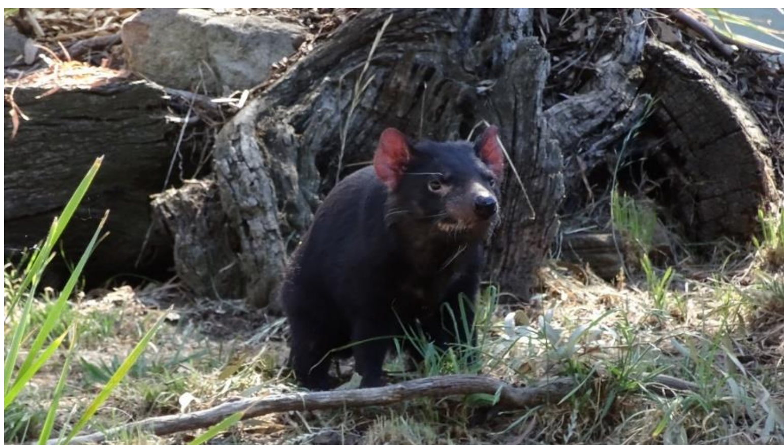
12 Tasmanian Devil