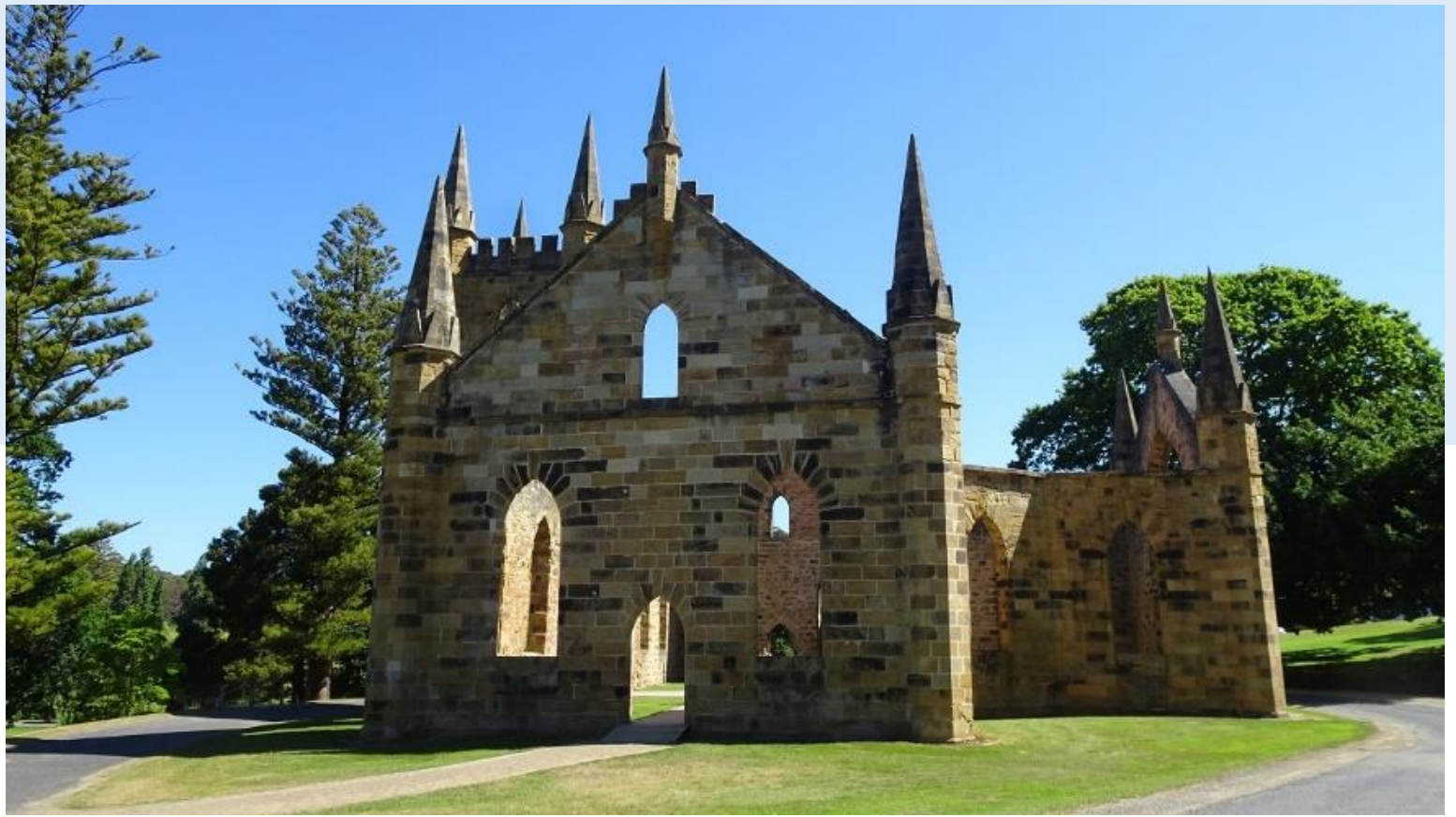
2 Penitentiary Church