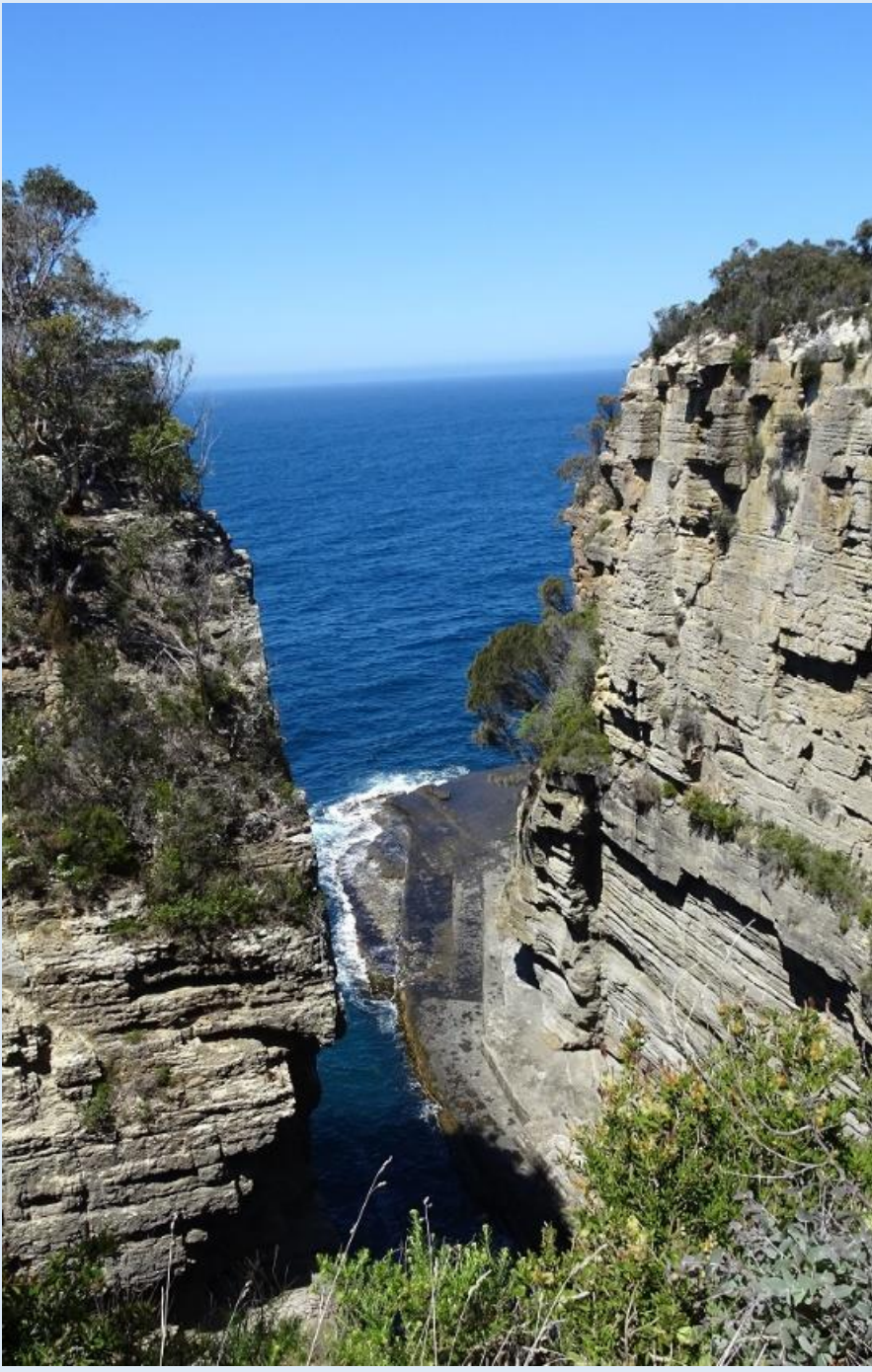
4 Tasmans Arch