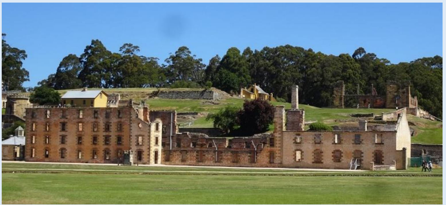
1 Port Arthur Penitentiary

Over forty percent of the land area is protected national parks and World Heritage sites. Tasmania is noted for unique flora and fauna including the infamous Tasmanian Devil.