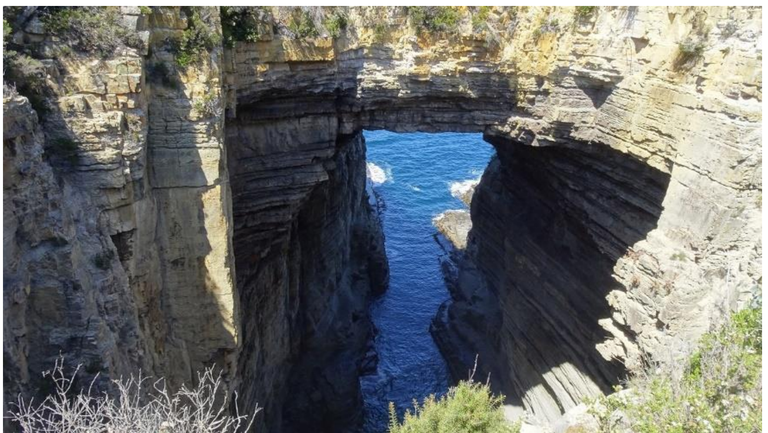
3 Devils Kitchen