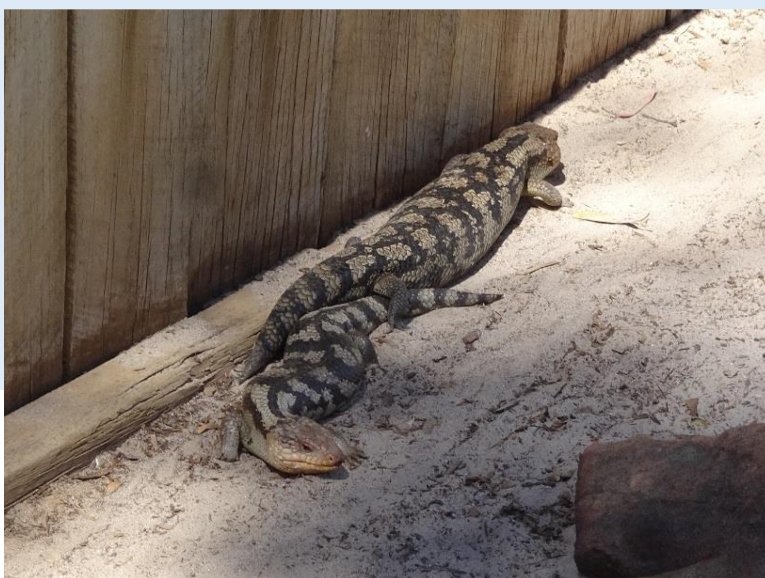
11 Blotched Blue-Tongued Lizard